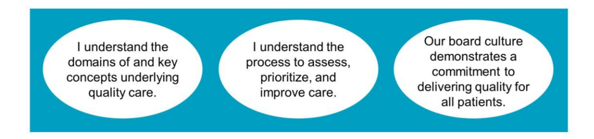
Figure 1. Vision of Effective Board Governance of Health System Quality

IHI worked with the expert group to establish an aspirational vision for trustees: With the ideal education in and knowledge of quality concepts, every trustee will be able to respond to three statements in the affirmative (see Figure 1).