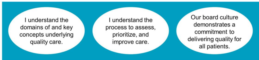
Figure 1. Vision of Effective Board Governance of Health System Quality

IHI worked with the expert group to establish an aspirational vision for trustees: With the ideal education in and knowledge of quality concepts, every trustee will be able to respond to three statements in the affirmative (see Figure 1).