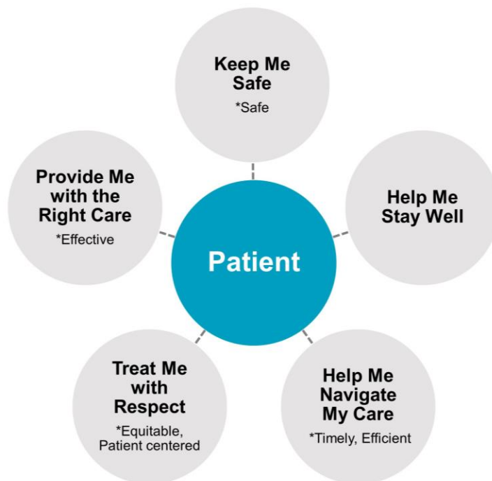
Figure 3. Core Components of Quality from the Patient’s Perspective

*IOM STEEEP dimensions of quality: Safe, Timely, Effective, Efficient, Equitable, and Patient centered